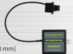
Motor Current Sensor