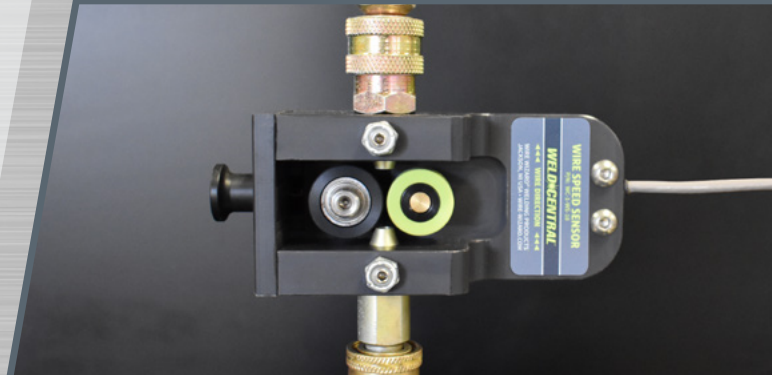
WIRE SPEED SENSOR