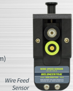
Wire Feed Sensor